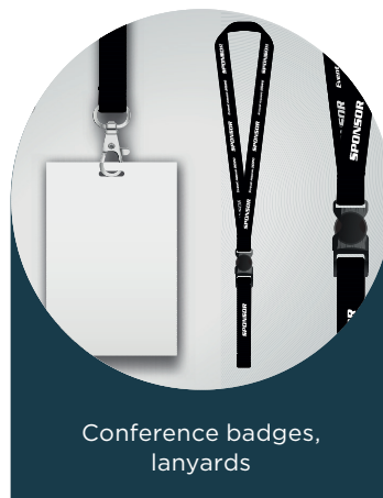
Conference badges, lanyards