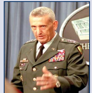
Gen. Tommy Franks

Retired General in the United States Army, previously serving as the Commander-in-Chief of United States Central Command