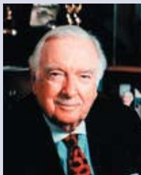
Walter Cronkite former CBS News Anchor