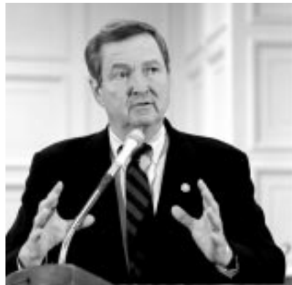
Congressman Clay Shaw of Florida discusses the Archer-Shaw plan to reform Social Security with private retirement accounts.