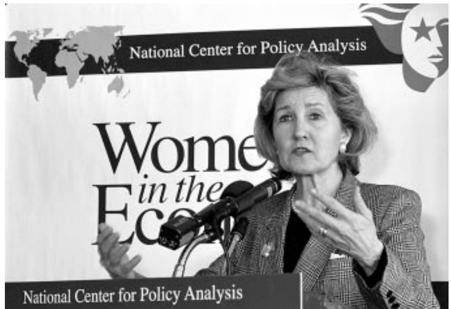
Senator Kay Bailey Hutchison speaks at the NCPA's Women in the Economy conference at the National Press Club in Washington, D.C.

Conference speakers discussed a variety of issues, from how the tax law systematically discriminates against two-earner couples to how federal policies toward pensions discriminate against women who move in and out of the labor market and change jobs.