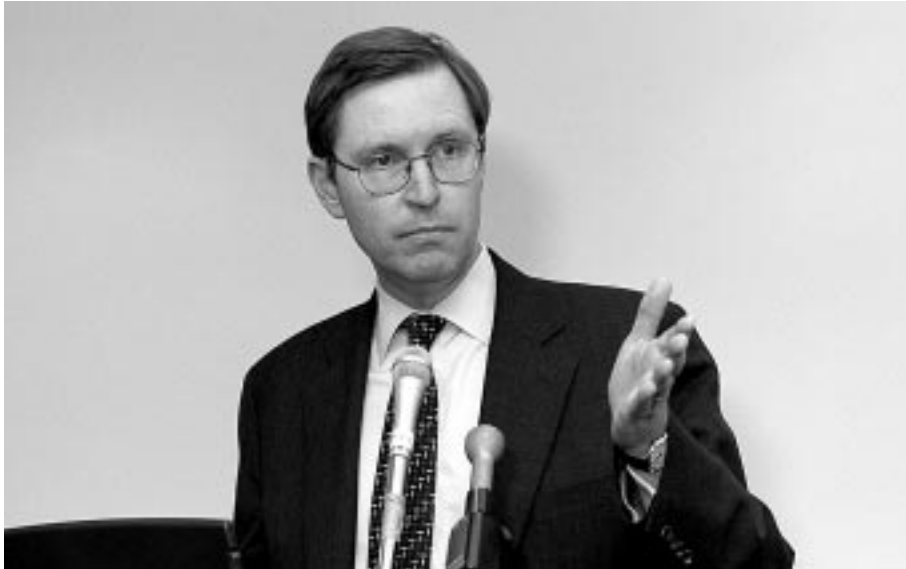
R. Glenn Hubbard, Chairman of the Council of Economic Advisors.