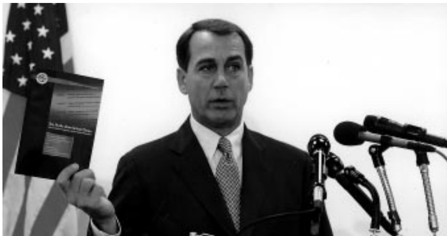
Rep. John Boehner (R-Ohio) speaks at an NCPA news conference.