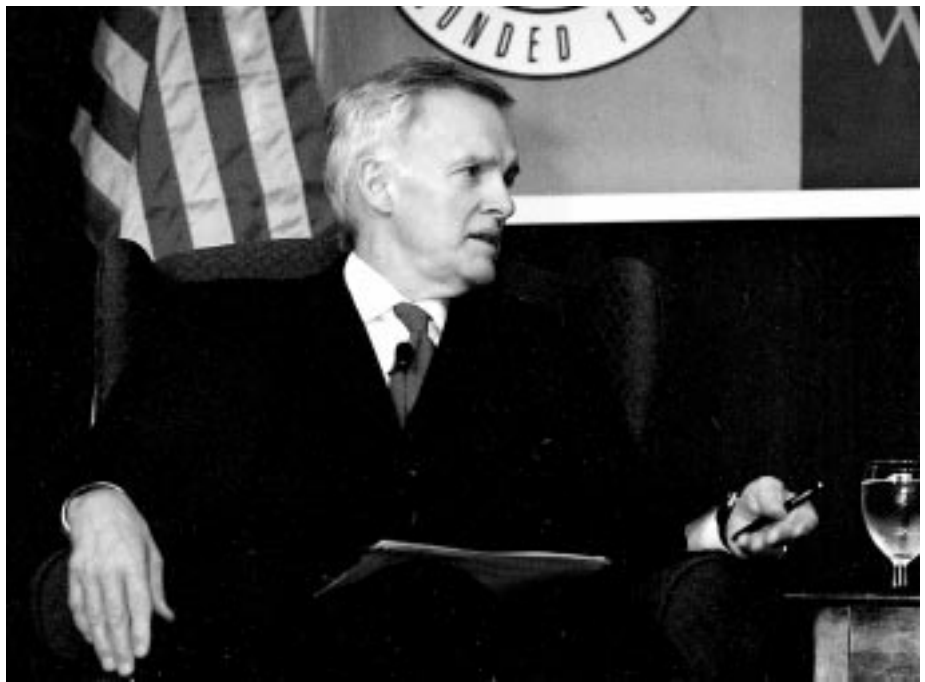
Senator Robert Kerrey speaks at a recent Hatton W. Summers Lecture.