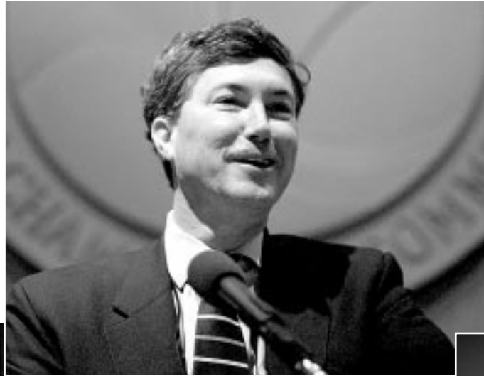
Thomas A. Scully, in his first public appearance as the new administrator of the Center for Medicare and Medicaid Services (formerly known as the Health Care Financing Administration)