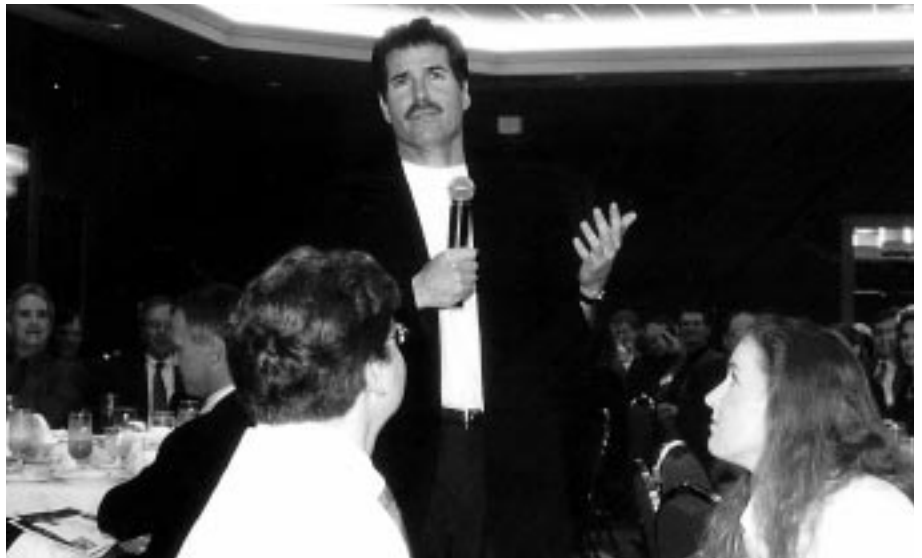
John Stossel takes questions from the audience during a recent Sumners Lecture Series luncheon.