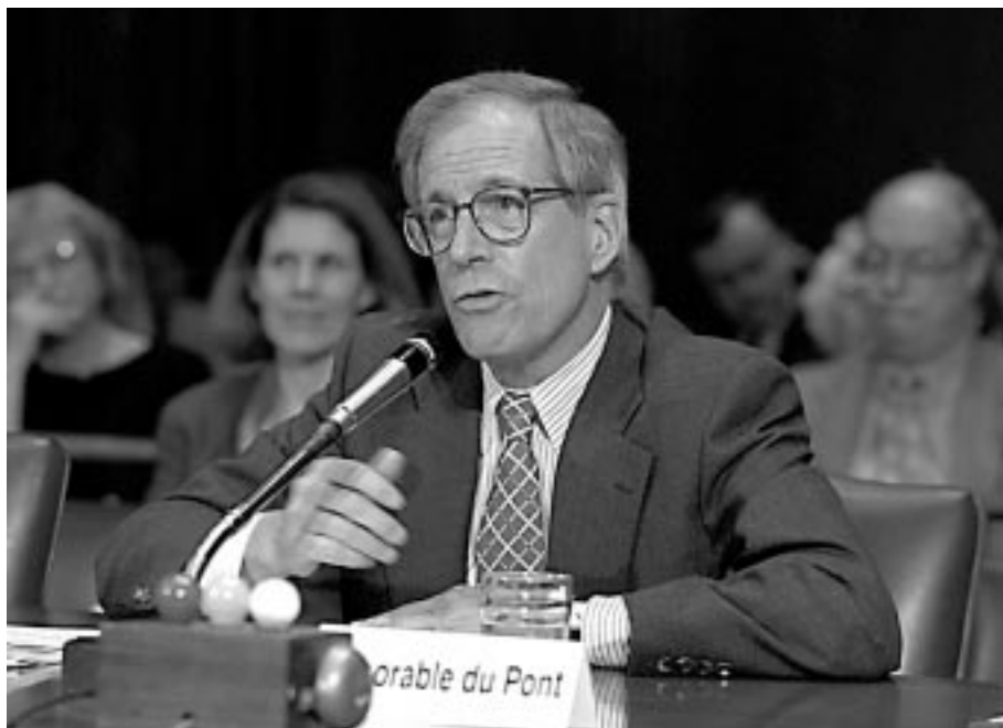
NCPA Policy Chairman Pete du Pont was recently cited as one of 100 Delawareans of the Century in the Wilmington News-Journal.