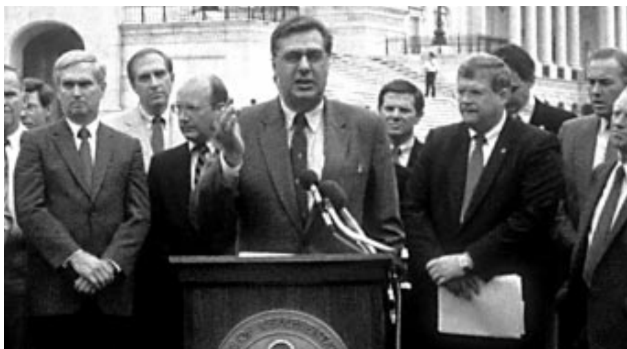
Rep. Dick Armey with other members of Congress at the 1989 unveiling of an NCPA study calling for the repeal of the Social Security earnings test.

In 1989, members of Congress, including Dick Armey, Dennis Hastert and Lynn Martin, stood in front of the nation's Capitol to release an NCPA study calling for the repeal of the Social Security earnings test.