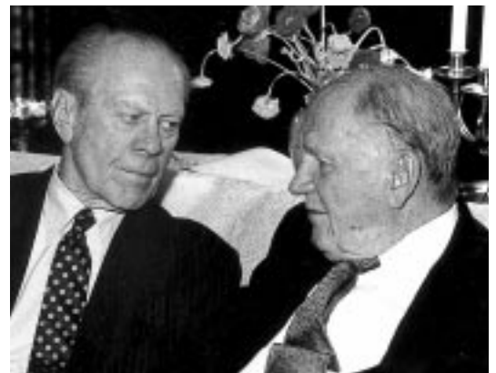
President Ford and Trammell Crow.

Ford said his worst moment as president was watching from the Oval Office as